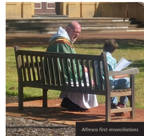
Alfresco first reconciliations

The congregation was equally delighted to take part in morning tea after Mass, made extra special with homemade treats, which parishioners brought along to share.