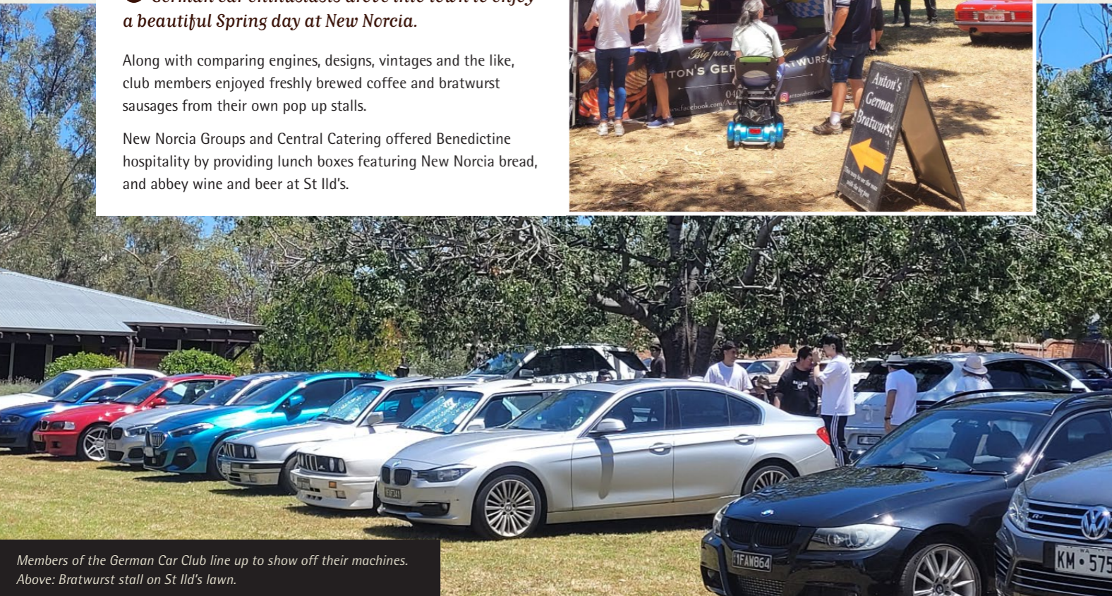
Members of the German Car Club line up to show off their machines. Above: Bratwurst stall on St Ild's lawn.