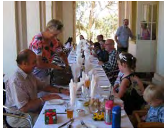
Parishioners enjoying lunch at the Hotel