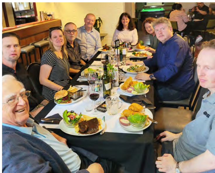
The group enjoying lunch at the Bolgart Hotel