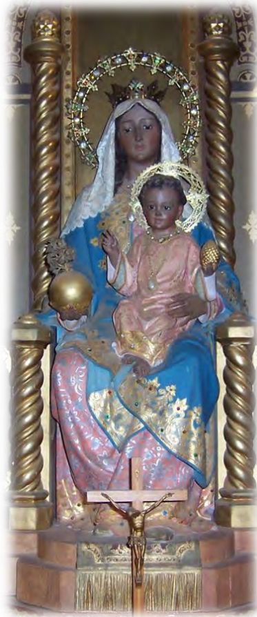
Oratory, Holy Trinity Abbey, New Norcia

Feliz Navidad / Bon Nadal / Boas Festas Bones Festes Buon Natale / Joyeux Noël Frohe Weihnachten / Feliz Natal!