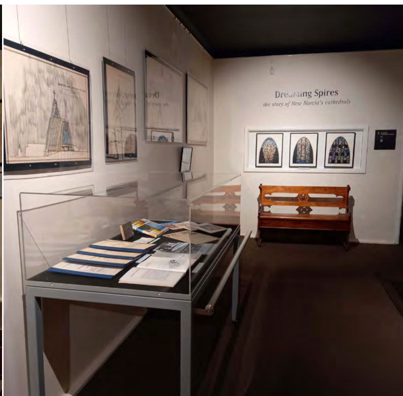
Left & Right: photo credit to Vida Whale